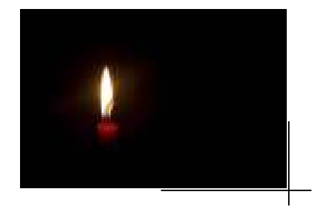
Suffering is like a lantern which indicates the direction of the road